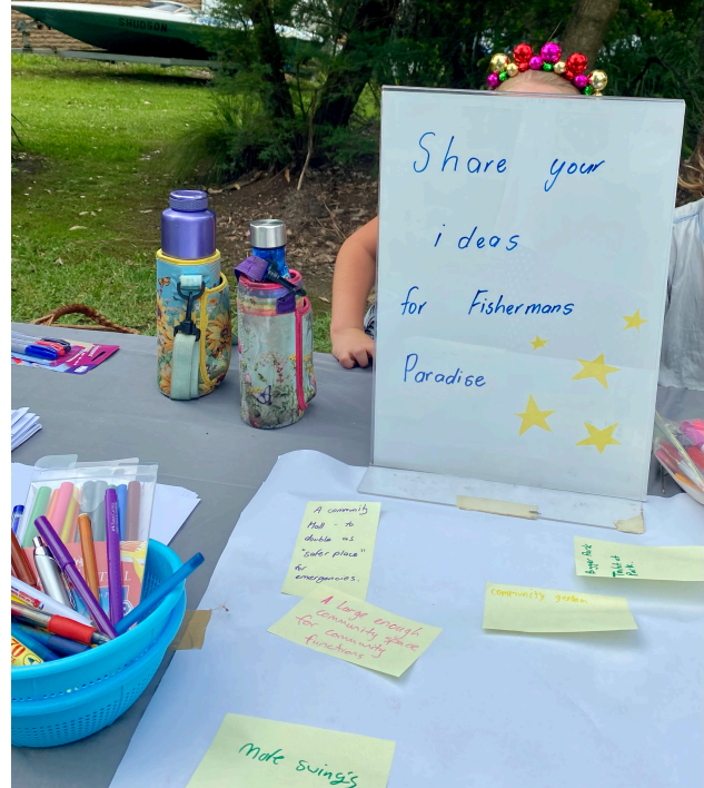
RFS Christmas event 15th December 2024

Ideas (main themes): Upgrade playground, safe swimming place, large meeting place/community hall, rebuild boardwalk lost in bushfires, toilets at park.